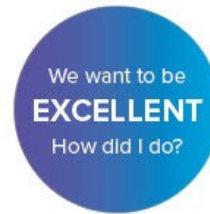
PATIENT SATISFACTION BUTTONS