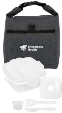
EMPLOYEE WELCOME GIFT